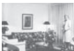
1981 Charter House Information Office/Model Apartment opens