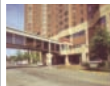
1992 Skyway Link Project completed