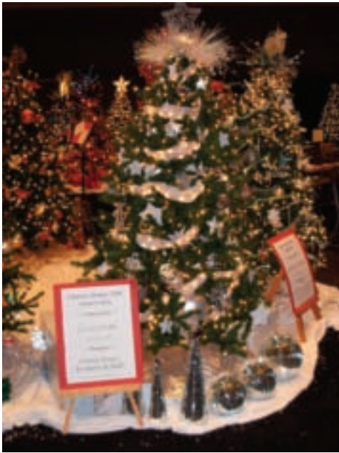
Charter House residents designed this beautiful tree for the 24th Festival of Trees held at the Mayo Civic Center in November. The event raises funds for Rochester's Hiawatha Homes Inc. to help them provide residential, in-home, and community-based choices for people with disabilities.