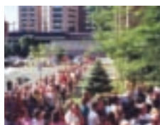
1989 First annual Sidewalk Sale