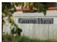
1987 First Annual Resident State-of-the-House Address