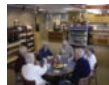
2004 Expanded Corner Cupboard opens