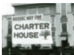
1977 Christ United Methodist Church proposes Retirement Center to Rochester Methodist Hospital