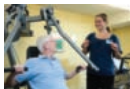
2004 Charter House Fitness Center opens