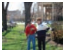
2003 Charter House adopts Central Park