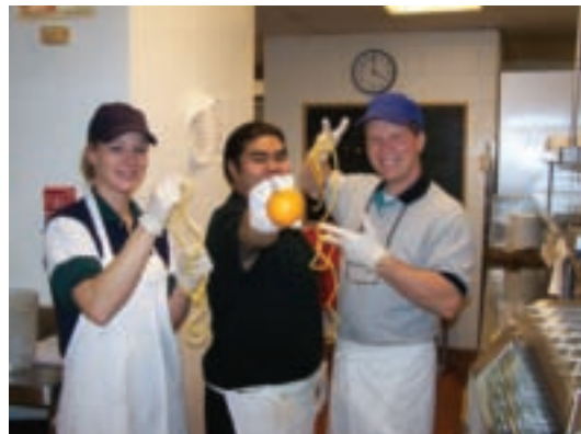
Charter House dining services staff having fun preparing garnish for the 25th Anniversary Resident Dinner.