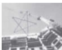
1983 Charter House Christmas Star tradition begins