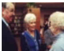
2002 Dedication of John A. Higgins Library