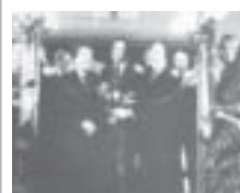
1985 Charter House opens